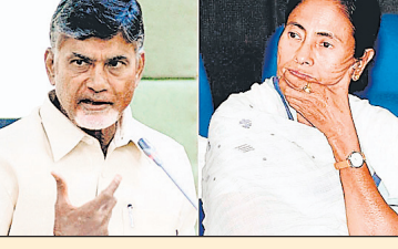
newly installed Congress regime in Chhattisgarh that 'withdraws' general sanction for the functioning of the premier agency in these states.

"When I was Gujarat Chief Minister for long 12 years continuously, they did everything to harass me. Congress, their remote controlled officers and the entire Sultanat have not spared a single opportunity to harass me." "There was no single agency, which did not create problems for me or harass me....," Prime Minister said.