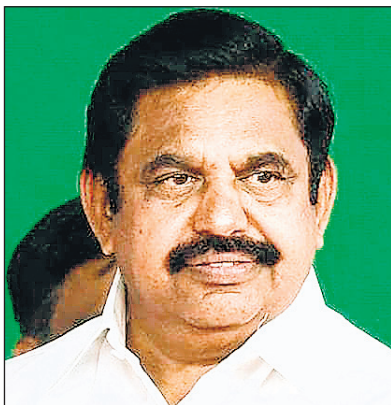
Strongly condemning it, he said it was a deep-rooted conspiracy and all those behind this act would soon

Agencies, Chennai Tamil Nadu Chief Minister Edappadi K Palaniswami on Saturday denied any links with the murder of a security guard and break-in at late Chief Minister Jayalitha's Kodanad Estate bungalow in 2017, as claimed in a video release by former Tehelka journalist and said legal action would be taken against those involved in publishing such false information.