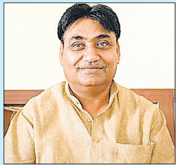
directed the officials to reinstate the word Rajasthan in the talent search examination," he said.