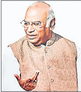
han' and said that "it is not becoming of a Prime Minister to say that".

Strongly refuting the Prime Minister Narendra Modi's remark that Congress in Karnataka is treating Chief Minister H D Kumaraswamy as a 'clerk' Congress leader in the Loka Sabha M Mallikarjuna Kharge said that "PM's assumption is wrong".