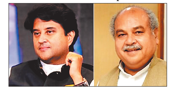
Gwalior - Till now only Digvijay Singh has