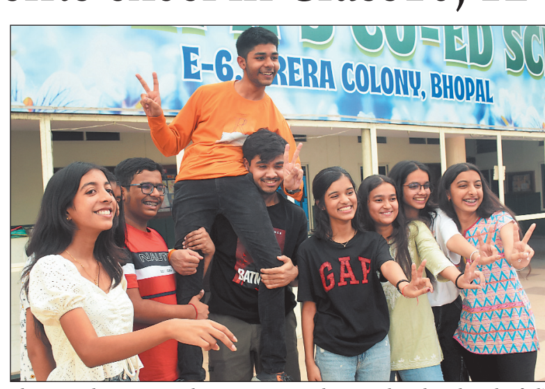
Class 10 and 12 CBSE results were announced on Monday.