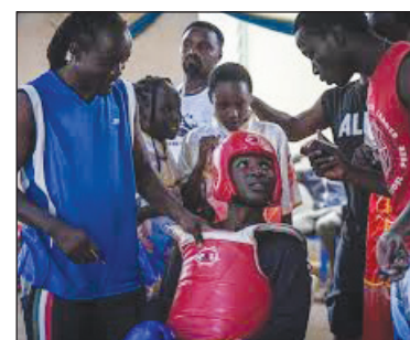
young contestants were drawn from many parts of the country, reaffirming the growing popularity of Chinese martial arts. We are glad to witness the gradual embrace of Kung Fu by children as young as four years old.