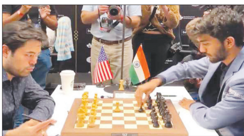
Gukesh and Nakamura play a chess match during the Candidates Chess Tournament in Toronto.

Toronto (UNI) In a thrilling conclusion to the Candidates Chess Tournament, 17-year-old Indian Grandmaster D Gukesh secured a crucial draw against American chess prodigy Hikaru Nakamura in the 14th and final round here. With this, Gukesh concluded the tournament with nine points out of a possible 14, clinching the title and making history as the youngest-ever challenger to win the world chess title. This monumental victory propels Gukesh into a highly anticipated showdown with reigning world champion Ding Liren of China in the forthcoming world championship, scheduled for the last quarter of the year. Chess enthusiasts around the globe eagerly await this clash of titans, as Gukesh looks to challenge Ding Liren for the coveted world title. The Chennai lad outpaced Garry Kasparov's record by a significant margin. The Russian chess maestro was 22 when he first qualified to challenge compatriot Anatoly Karpov in 1984.