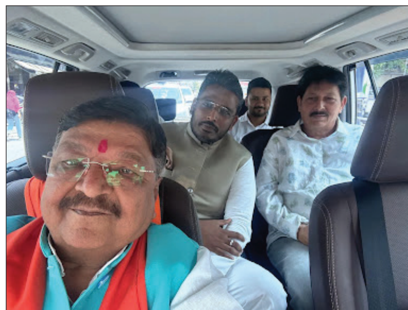
Chronicle Reporter, Bhopal