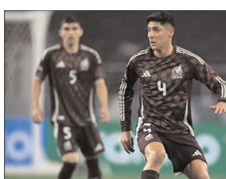
Jaime Lozano's men will begin the continental tournament against Jamaica on June 22 before also meeting Venezuela and Ecuador in the group stage.

Mexico City, (UNI) Mexico captain Edson Alvarez has guaranteed El Tri will be prepared for the upcoming Copa America in the United States despite the team's faltering recent form. The comments followed a 4-0 friendly defeat to Uruguay in Denver on Wednesday, Mexico's fourth defeat in seven games. "We know that we have to be patient and unite like a family," the West Ham defensive midfielder said. "It's difficult because we don't like to lose. But these games are what makes you grow; you compete against elite players, you measure yourself against who you want to be." Mexico will finalize their Copa America preparations with a friendly against Brazil at Kyle Field in College Station, Texas, on Saturday.