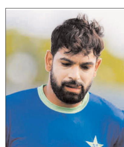
saw the ball being replaced just two overs before Theron's allegation. His sharp observation and subsequent accusation have cast a shadow over what was an eagerly anticipated game.

Bridgetown, (UNI) A storm of controversy has erupted in the cricketing world as former South African pacer Rusty Theron has accused Pakistan Cricketer Haris Rauf of ball tampering during their match against the USA. Theron, known for his fiery pace and competitive spirit, took to social media to voice his concerns. "Are we just going to pretend Pakistan aren't scratching the hell out of this freshly changed ball? Reversing the ball that's just been changed 2 overs ago? You can see Haris Rauf running his thumbnail over the ball at the top of his mark," he Xed, tagging both the International Cricket Council (ICC) and USA Cricket. The match, part of the ongoing T20 World Cup tournament,