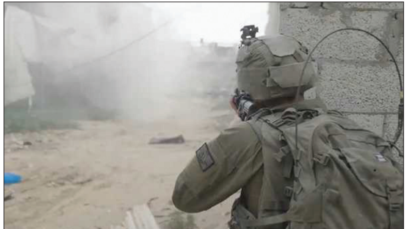
from the West Bank to enter the