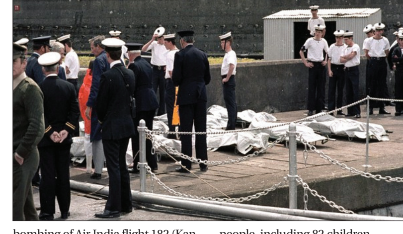
bombing of Air India flight 182 (Kanishka), which claimed the lives of 329

The Consulate General of India in Toronto said that an annual memorial service is being held at South Lawns, Queen's Park, in Toronto to mark the 39th anniversary of the