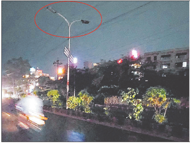
Road before Anna Nagar

One is rain and on top of that darkness, in such conditions people are facing a lot of trouble walking on roads and driving vehicles. Accidents are happening every day at night. And at the same time chain snatchers are active. Due to which it has become difficult for women to go out, they feel unsafe, but despite this the Municipal Corporation, public representatives and administration are not serious about getting the street lights fixed. In such a situation, who will be responsible if a big accident happens. In the capital, BHEL area, Kolar, Ayodhya Bypass Road, Anna Nagar, Raisen Road, road before Anna Nagar, Security Line, Piplani 100 Quarter, Bhanpur Road, road from Bansal Hospital to JK Hospital, Ratnagiri to Bhanpur Road, Piplani B Sector to Khajuri Kalan Road, Mahatma Gandhi to Avadhपुरी, Govindपुरा Police Station to Security Line, Karond, Chunabhatti, Char Imli, Saket Nagar, Bagsewaniya to