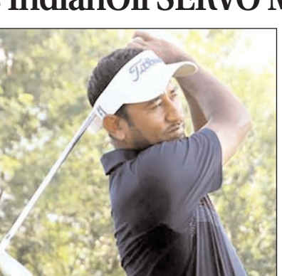
He secured the title by a narrow one-shot margin.