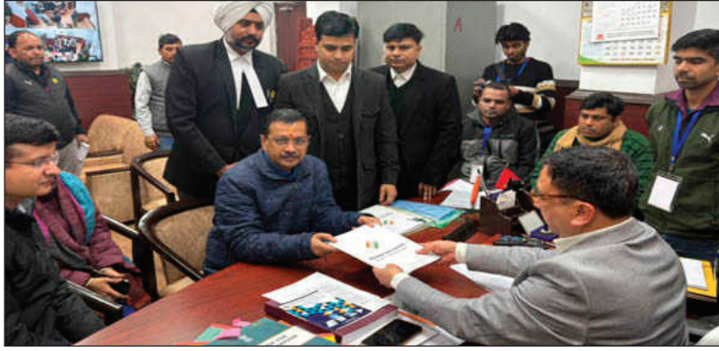
one to send their blessings and good wishes from wherever they are so that we can secure another historic victory this time." Kejriwal then walked to the District Magistrate's office to complete the nomination process.

New Delhi (UNI) Aam Aadmi Party (AAP) National Convener and former Delhi Chief Minister Arvind Kejriwal on Wednesday filed his nomination from the New Delhi Assembly seat. After filing his nomination, Kejriwal urged people to vote for a party that works, stating, "On one side is a party that works, and on the other is a party that only abuses. We are contesting elections based on our 10 years of work and what we aim to do in the next five years." Addressing the media before heading to file his nomination, Kejriwal said, "I am going to file my nomination from the New Delhi Assembly seat. Mothers and sisters from all corners of Delhi have gathered here. They will accompany me to the nomination filing. I request every-