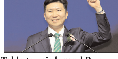
Table tennis legend Ryu Seung-min elected as KSOC President

They were not just the two, but everyone else tried their best to contribute; they knew they were entering the Indian women's futsal hall of fame that would stay forever.