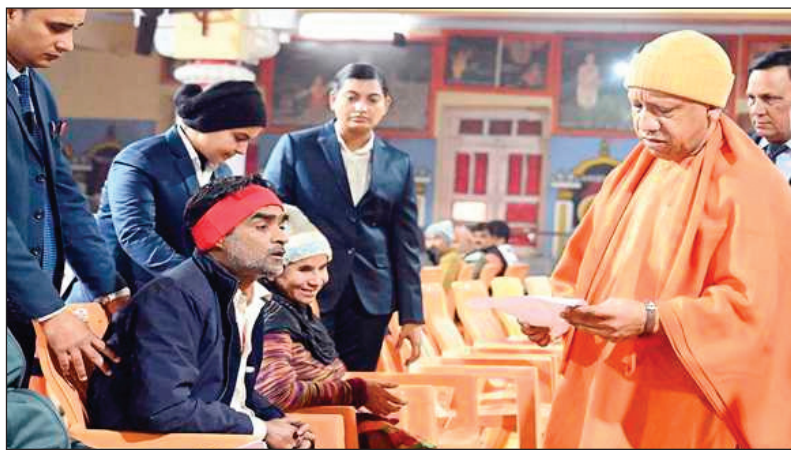
government was committed to resolving the problems of every individual in need. During the Janata Darshan, several