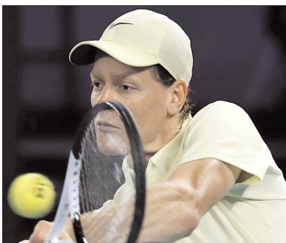
semifinal record to 3-2. Alexander Zverev in The Italian will face Sunday's final after the

Melbourne, (UNI) Jannik Sinner, the defending Australian Open men's singles champion, secured his place in the final with a commanding straight-sets victory over American Ben Shelton here on Friday night. The top seed triumphed 7-6(2), 6-2, 6-2 in their semifinal at Rod Laver Arena, extending his impressive run at Melbourne Park. Sinner, who claimed his second Grand Slam title at last year's Australian Open, needed 2 hours and 36 minutes to dismiss Shelton and improve his Grand Slam