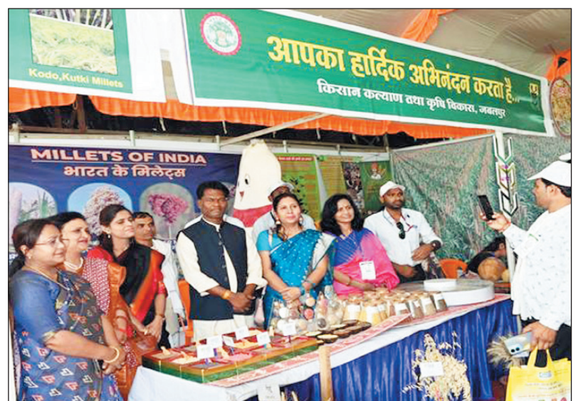
relief from stomach disorders and

While many stalls focused on millets, the Berry Natural Health Drink, made from the native plum by Manavta Natural Food Processing Private Limited from Tikamgarh district, captured significant attention due to its unique taste. The seller highlighted that this chemical-free organic drink is rich in iron, vitamins, fiber, and antioxidants, and is also sugar-free. He noted that the drink not only pro-