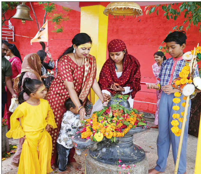
Devotees take part in rituals on first Somwar of Sawan in the city.

From the early hours of the morning, a palpable sense of devotion and reverence enveloped the city. The streets leading to prominent Shiva temples Khatla Pura