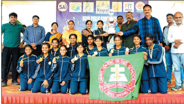
Bhopal: Carmel Convent Sr. Sec. School, BHEL, Bhopal, has made the city of Bhopal proud by clinching the Under-19 Kho-Kho Championship at the CBSE Cluster Level Competitions. With this remarkable