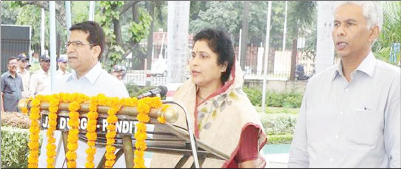
Bhopal: In a proud tradition to mark the beginning of the month, government officials and employees gathered at the Sardar Vallabhbhai Patel Park in front of the Mantralaya for a collective singing of the national song, ‘Vande Mataram’, and the national anthem, ‘Jana Gana Mana’. The event, held on the first working day of August, served as a powerful display of national unity and pride. The atmosphere was further uplifted by the