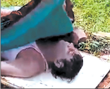
Bhopal: Panic gripped the Ratibad area today after the body of an unidentified man was discovered near the Bhadbhada bridge. Commuters who spotted the body immediately alerted the police, prompting a swift and commendable