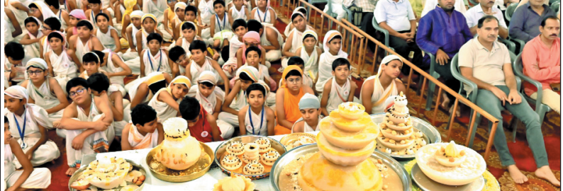
Bhopal: Today, the Jain community across the country is joyously celebrating the “Moksha Kalyanak” of Lord Shri Parasnath Swami. In a significant display of devotion, lakhs of devotees are offering Nirvana Laddu at the “Swarna Bhadrakut” in Tirtharaj Shri Sammedshikhar. Reflecting this spirit, devotees from Bhopal and various