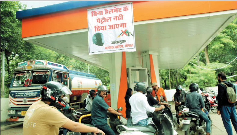
2-wheeler riders without helmet were denied fuel at petrol stations in the city on Friday.

Bhopal: Starting August 1, Bhopal has implemented a new regulation requiring two-wheeler drivers to wear helmets in order to purchase petrol. On the first day of enforcement, many petrol stations initially allowed drivers to fill their tanks without helmets. However, as officials began monitoring compliance, petrol pump operators became stricter. Reports indicate that numerous students were denied petrol at the Ratnagiri petrol pump due to their lack of helmets. Manju Gurjar, a pump worker, said that she turned away over 100 people, informing them that helmets were mandatory for refueling. Similar scenes unfolded at other petrol stations, including two pumps in New Market and one at