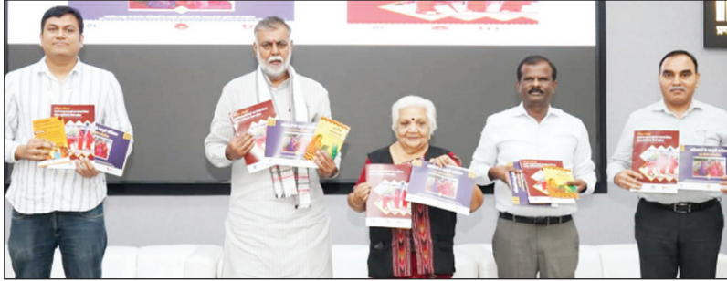
highlighted how the Narmada River, a vital source in Madhya Pradesh, is a symbol of traditional wisdom that is being neglected by the educated populace. Meanwhile, Palta, founder of the

Bhopal: Rural India's future isn't just about economic growth—it's about creating safe, inclusive, and sustainable communities, with women at the center. That was the powerful message from the Fifth Edition of the India Rural Colloquy, organized by Transform Rural India (TRI) at the Indian Institute of Forest Management in Bhopal. The colloquy brought together a diverse group of voices, including the Minister of Panchayat and Rural Development, Padma Shri Janak Palta, and numerous grassroots leaders. The minister emphasized the need to move beyond purely technological solutions, urging a return to human values and ecological accountability. He