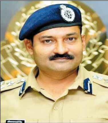
Bhopal: In a stern directive aimed at promoting road safety, Bhopal Police Commissioner Hari Narayan Chari has ordered all police personnel in the city to strictly adhere to traffic safety rules. Effective immediately, officers on two-

wheelers must wear a helmet, and those in four-wheelers must buckle up. The move comes as both Indore and Bhopal began enforcing a “no helmet, no petrol” rule on August 1. Commissioner Chari, known for his no-nonsense approach and a track record of success as the former Indore Police Commissioner, has made it clear that these rules are not optional. He issued a strong warning to his force: any officer found violating the new order will face “strict departmental action.” By holding his own force accountable for road safety, Commissioner Chari is setting a powerful example for the public. The mandate reinforces the message that traffic laws apply to everyone, regardless of their position, and aims to improve safety across the city's streets.