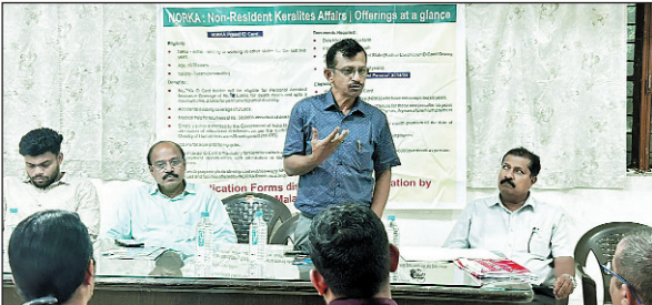
Bhopal: In a major outreach effort, the United Malayalee Association (UMA) recently hosted a series of camps to distribute NORKA ID cards and inform the community about welfare schemes available to them. The initiative, designed to benefit non-resident Keralites, saw strong participation across multiple locations in the city. The camps, held at