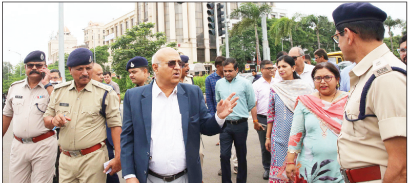
gathered information regarding past accidents. Police officials told that vehicles traveling from Nehru Nagar to Mata Mandir via Atal Path often speed, contributing to the high accident rate in the area. His inspection lasted about 20 minutes, focusing on the need for im-