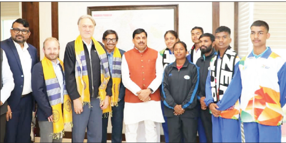
Bhopal: Chief Minister Dr. Mohan Yadav met with the talented young footballers from Vicharpur village in Shahdol, famously known as ‘Mini Brazil,’ at the Mantralaya on Tuesday. The players, who recently returned from an