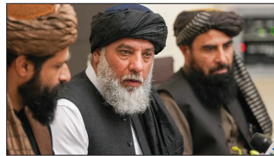
the caretaker Afghan government, took to his social media platform, stressing that a necessary response would be taken at a proper time.

Kabul: Kabul on Tuesday strongly condemned the Pakistani air strikes in the Afghan provinces of Paktika, Khost and Kunar, describing them as an infringement of the country's sovereignty and a violation of all internationally recognised norms.